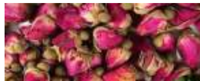
Dry Rose Petals