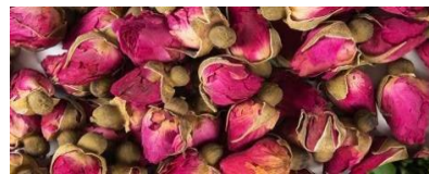
Dry Rose Petals